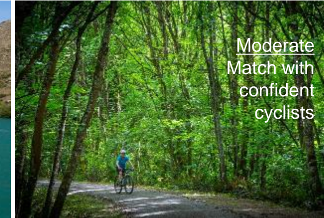
Roxburgh Gorge Trail: Grade 1-2