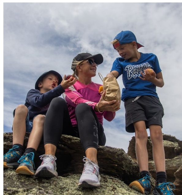
Table for two? Picnic by the lake? Farmers and orchardists grow export quality produce for our chefs to prepare for you to savour. Pick your own fruit or stop off at a roadside stall to stock up and nourish yourself and your family with nature's confectionary